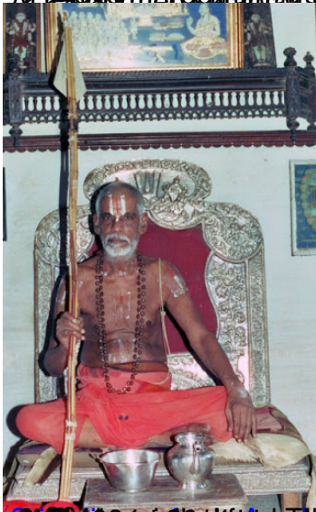
23. Pundarikopaswami (Pundarik) at Purmal and Ahayamatai Purmal